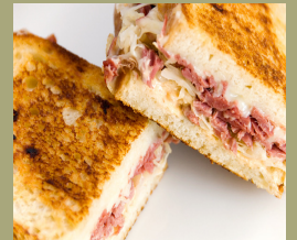
Grilled Reuben on Rye $5.95