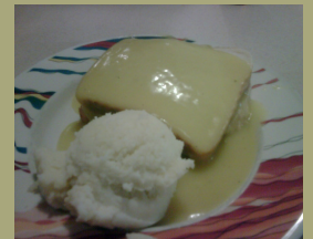
Hot Turkey Sandwich w/ Mashed Potatoes $7.45