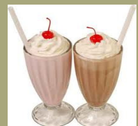
Milk Shakes $3.60