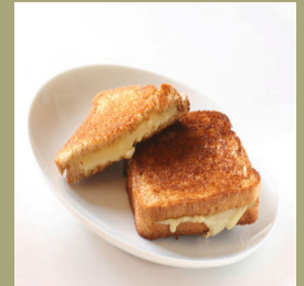
Grilled Cheese On Texas Toast $3.75