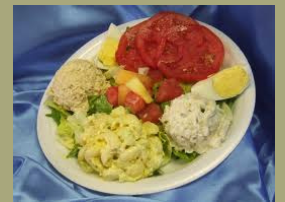
Chicken or Tuna Salad Platter $6.95