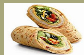
Turkey Wrap $6.85