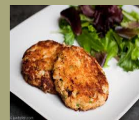
Crab Cakes $ 10.95

Consuming raw or undercooked Beef may increase your risk of food borne illness, especially if you have certain medical conditions We accept MasterCard and Visa