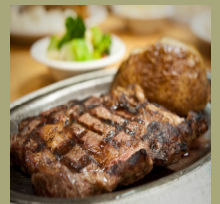
12 oz Charbroiled Delmonico Steak $12.95