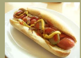
Kids Hot Dog $2.99