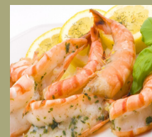
Fantail Shrimp $ 12.95