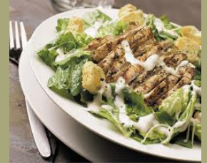
Grilled Chicken Caesar Salad $8.95