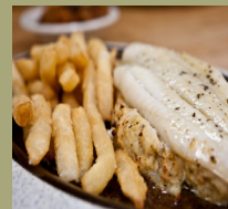
Stuffed Flounder $ 11.95