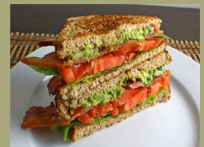
Triple Decker Club Sandwiches $6.95

Consuming raw or undercooked Beef may increase your risk of food borne illness, especially if you have certain medical conditions