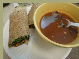
1/2 Wrap With Soup