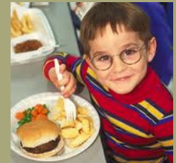
Kids Burger $3.49