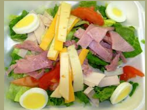
Chef Salad $6.95