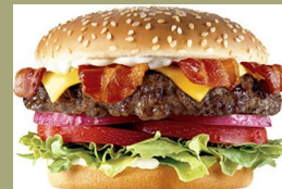
California Burger with Bacon $6.00