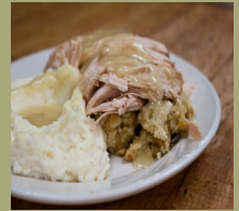
Slow Roasted Turkey $9.65